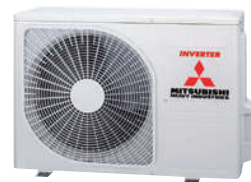
SRC20ZS-S, SRC25ZS-S SRC35ZS-S